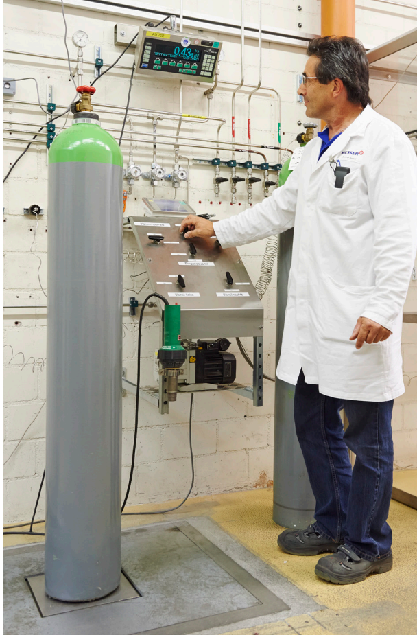
Gravimetric production of gas mixtures

more accurate determination of the actual value of the component. That is why the analysis values and their uncertainty are certified.