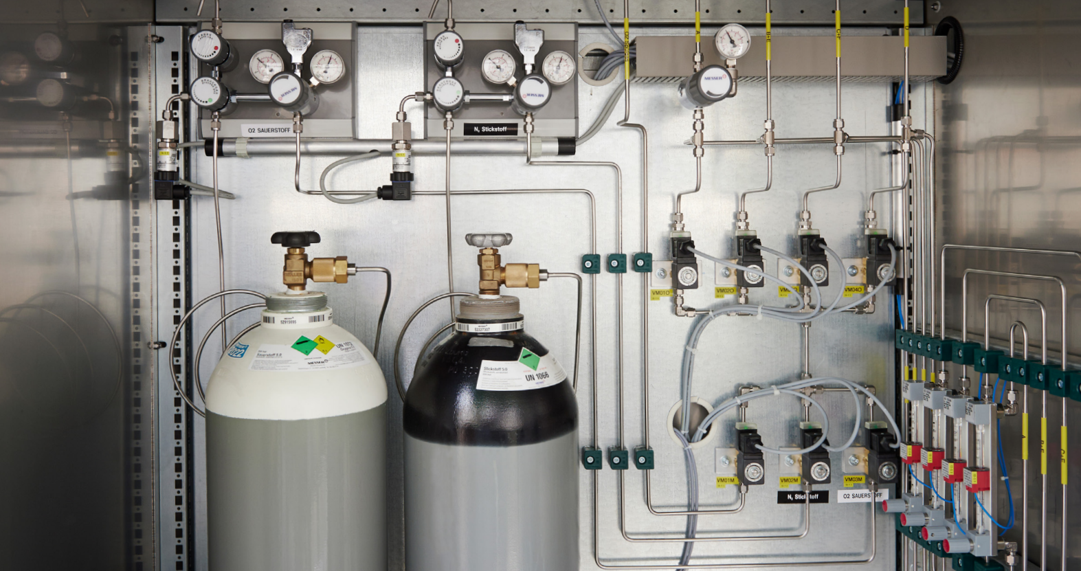
Central gas supply system